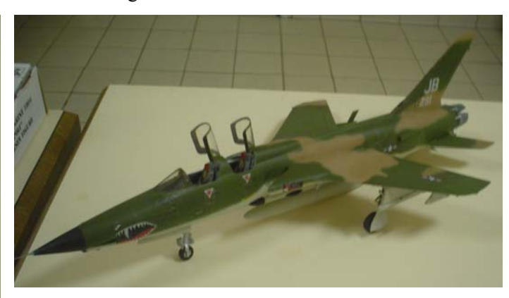
Left, Tamiya's F-84G Thunderjet in 1/72, OOB Above, Monogram's 1/48 F-105F Wild Weasel