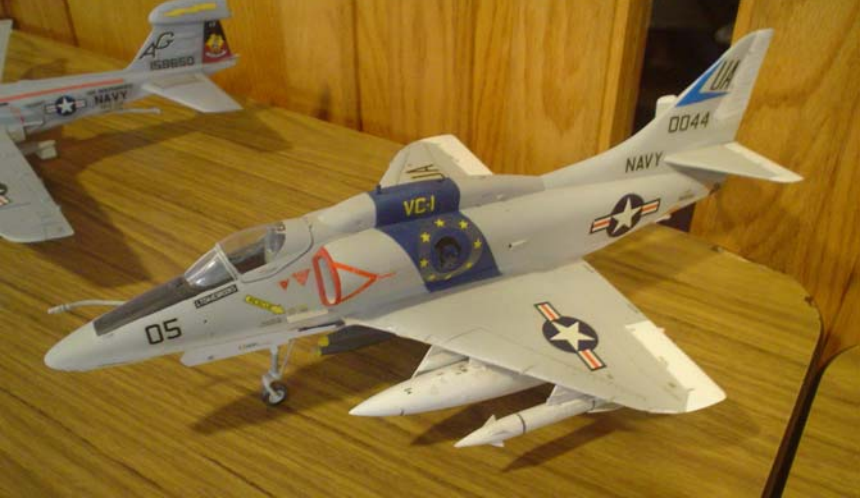
1<sup>st</sup>, 2<sup>nd</sup>, 3<sup>rd</sup>, all looking like winners as awards Another USN classic, "Heinemann's Hot Rod" an A-4 Skyhawk