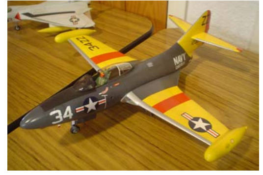
Fisher 1/32 Panther as a Drone.