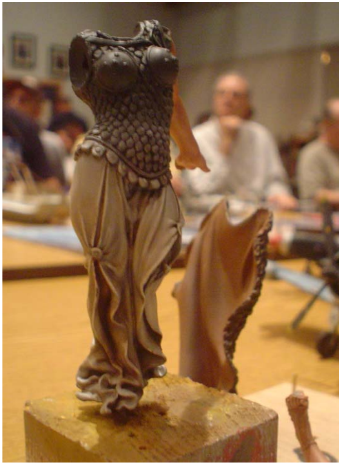
Left: Joe Fleming's figure has all the right points on display

With a need to balance the printed edition of the Styrene sheet in its fullest size, I make up this page with more good material that I wish I had Chris Bucholtz's masterful minute taking to illustrate. You'll all have to do with my scattered recollecting, mangled prose-ation instead - mick