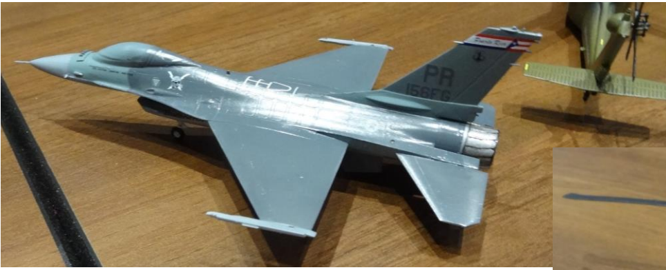
PRANG of course is the Puerto Rican Air National Guard, in case you didn't know.